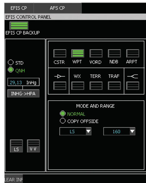
Figure 1. Screenshot of the prototype of the FCU Software

Following the presentation of a set of small examples (of increasing level of complexity), the tutorial will provide an interactive hands-on exercise extracted from an industrial case study (Flight Control Unit in an aircraft cockpit, see Fig. 1).