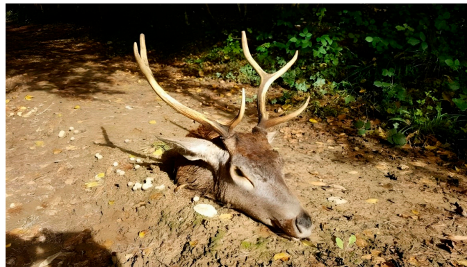
Figure 4. The head of a poached stag: the black spots are ticks, which are widely present on big game animals in the Argonne region (photograph by Romuald Weiss, a technician at the ONF).

“There had been poaching during the rutting season. [. . .] In the end we confiscated the head of the stag. [. . .] We’d tied a knot in the bag, we carried the head, it lasted 20 min, but there were ticks all over the car! [. . .] I had to go to a pharmacy to get an acaricide and I had to use it all weekend on the car. When I opened the car on Monday, there were dead ticks everywhere: on the seat, on the dashboard, everywhere! I had to take out all the clothes, shake everything out, empty and clean everything”. (interview, 20 May 2022)