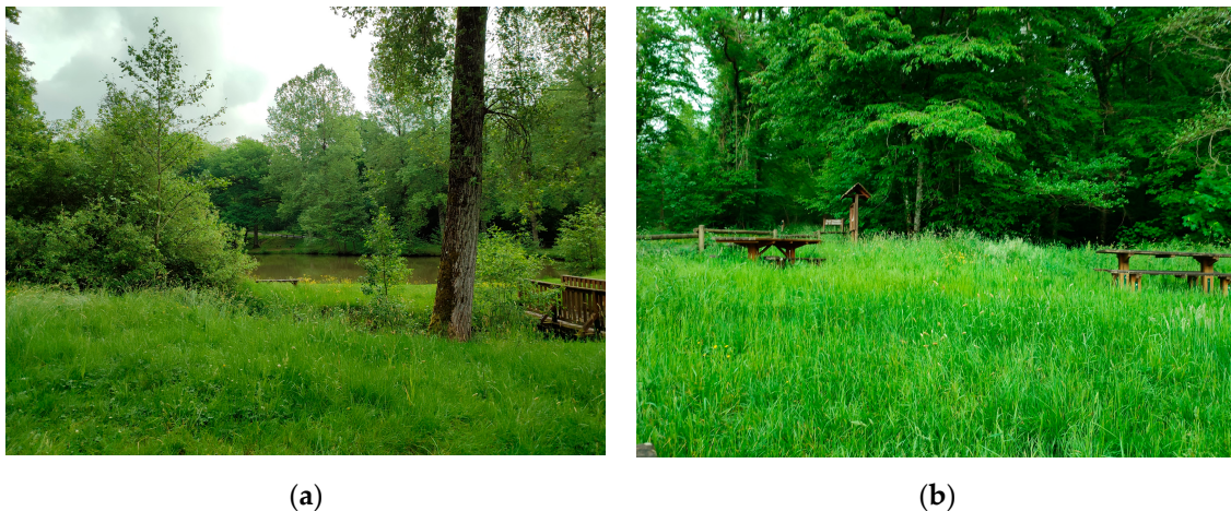
Figure 5. Field observation: at the picnic area of the Héronnière pond (a), vegetation is taking over from the facilities (b), emboldened by a wet start to spring. On site, a sign warns of the tick risk, but maintenance work does not seem to be carried out regularly. (Photographs by Aude Dziebowski, UMR SAGE, 20 May 2022).

“The Comcom is in charge of the upkeep of all the paths, the footpaths and mountain bike trails too. We only maintain the edges of the forest roads. [. . .] This means mowing the road verges, the grass and then down to the ditch and back ditch, to prevent the hazel trees from encroaching on the verges”. (interview, 20 May 2022)