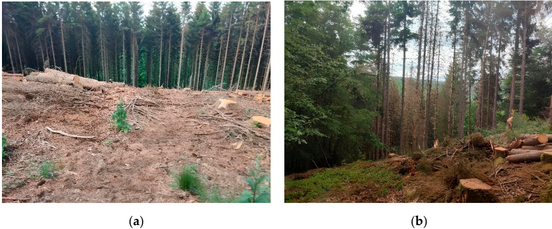
Figure 3. A spruce forest in the Argonne region that has become vulnerable to climate change following a bark beetle invasion, encouraging the spread of ticks. When storms are not knocking down the weakened trees (b), foresters are cutting down the affected plots to contain the pockets of contamination (a).

Douglas fir is the main food for deer. . . [ . . . ] All the ash trees along the river banks are dead, precisely because the fungus has developed better. [ . . . ] There aren't necessarily any trees to take over, so the herbaceous vegetation explodes, which favors the spread of ticks. [ . . . ] On plots with ash trees with ash dieback, as soon as they come into the light, there are ticks for you!". (interview, 20 May 2022)