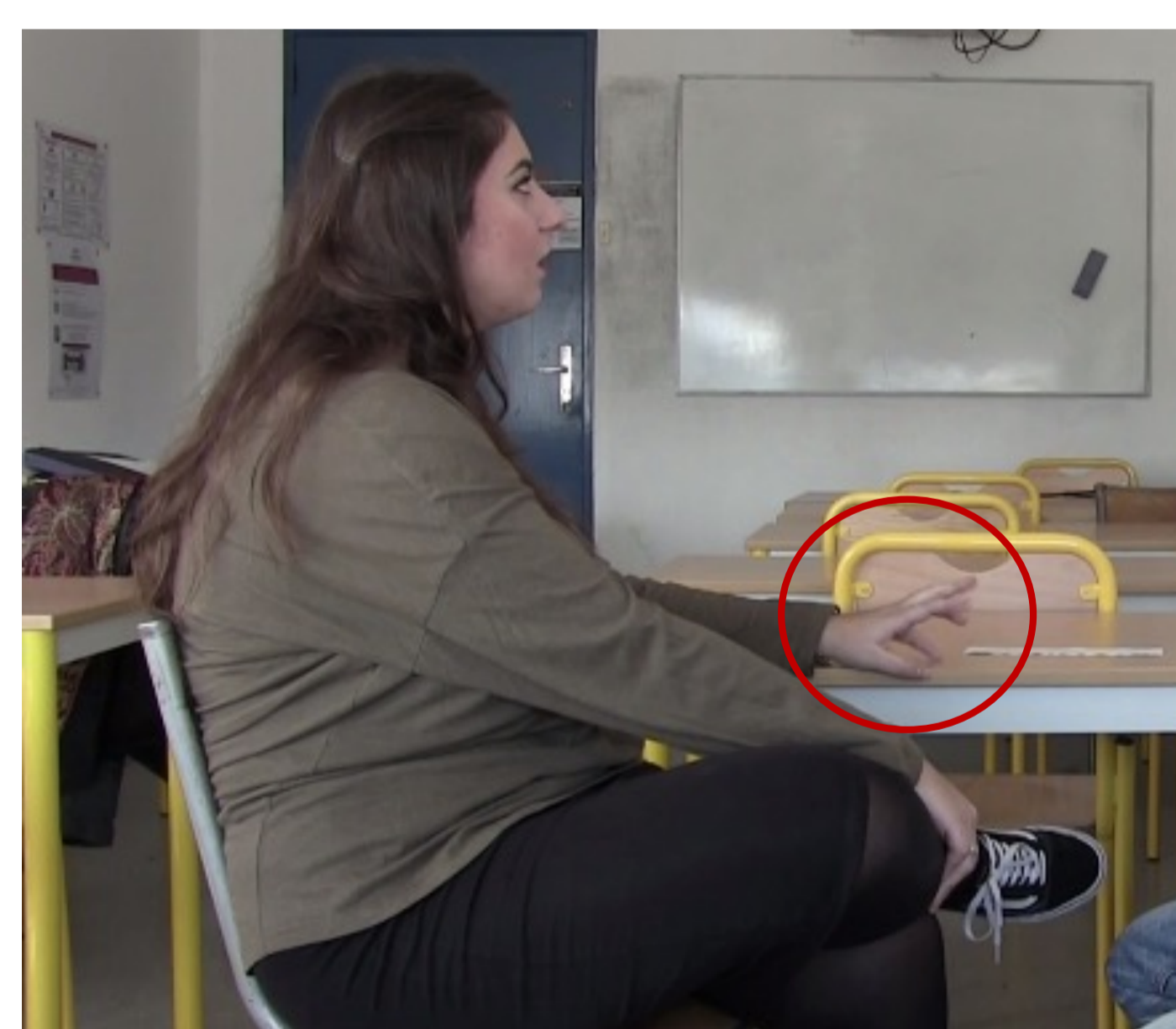
"Finger-tap" (Kosmala, 2021)