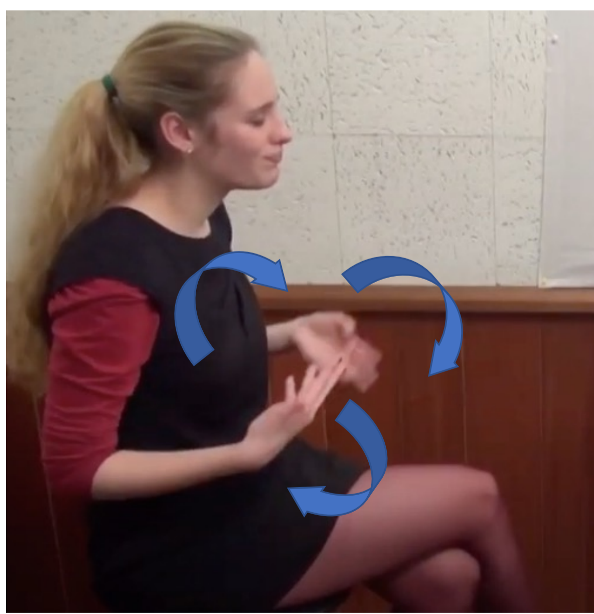
"Cyclic gesture" (Ladewig, 2014)

"thinking gestures" (Gullberg, 2011), "word-searching gestures" (Stam & Tellier, 2017) or "Butterworths" (Tellier & Stam, 2012) defined as metapragmatic gestures that enact a thinking or word searching activity.