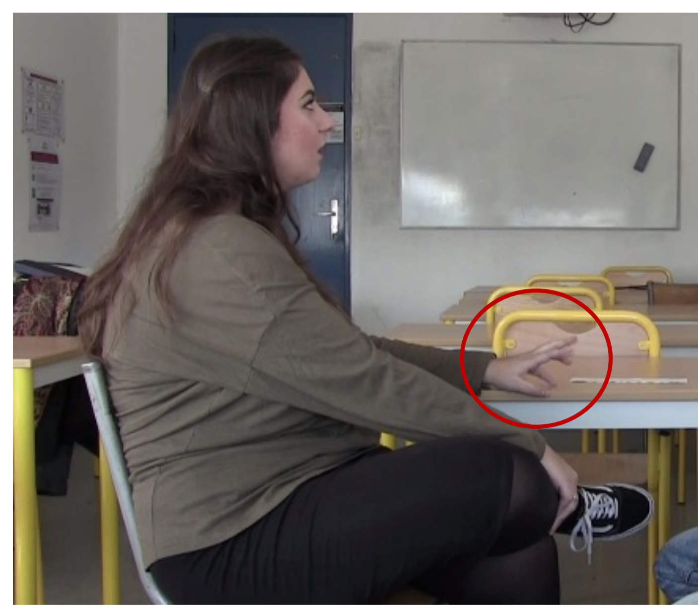
"Finger-tap" (Kosmala, 2021)