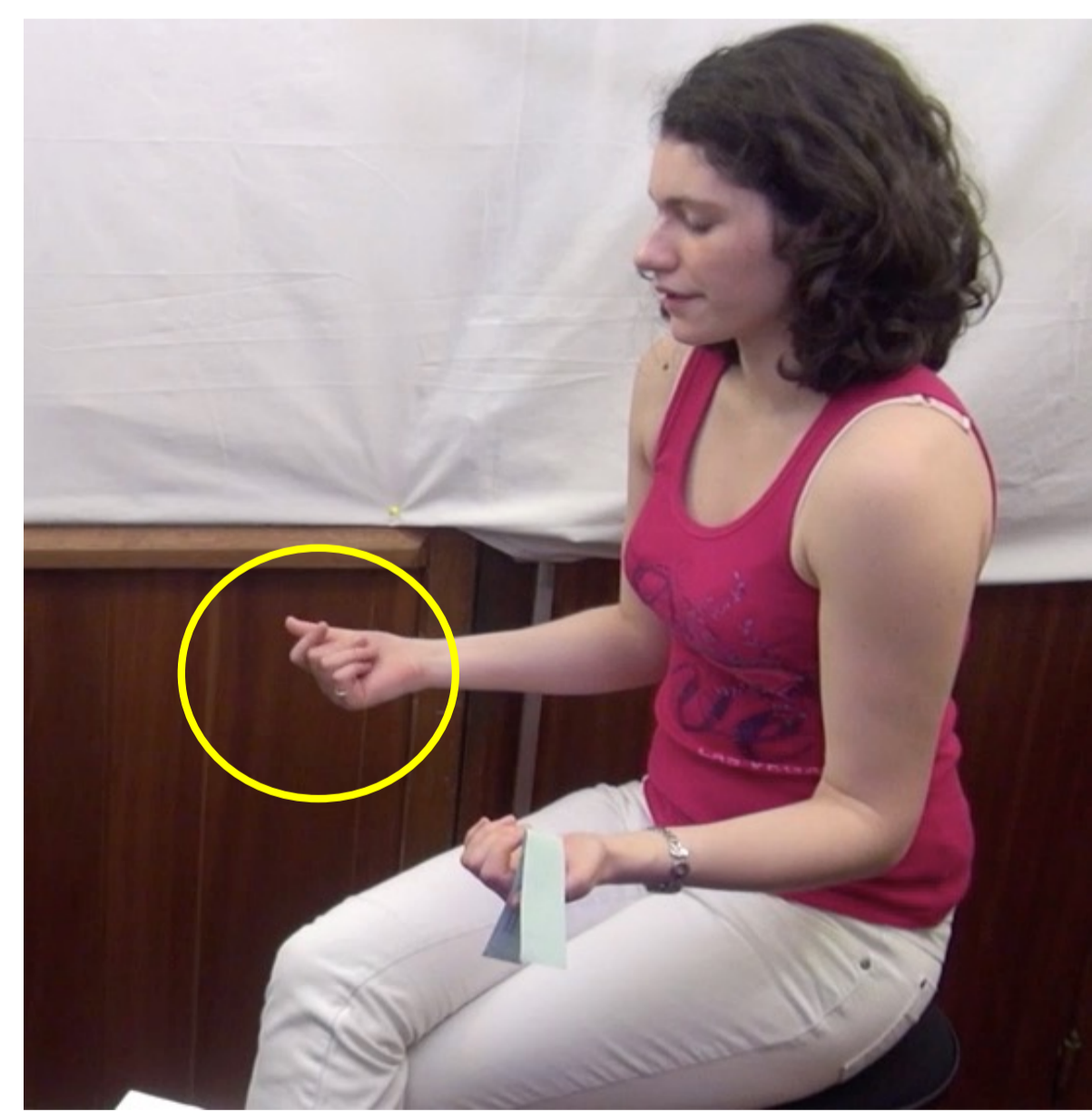
"Finger-snap" (Poggi, 2001)