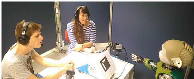
Fig. 1. Setup for the RoboTrio data collection.

The two studies most similar to our method are those by Stefanov et al [31] and Huang et al [12] through the use of machine learning algorithms. However, Stefanov et al [31] did not propose a subjective evaluation of their models and our study differs from that of Huang et al [12] due to the roles being asymmetric in our interaction (robot plays game as animator), and their robot could not move its head and its eyes. Another major difference is that we use the robot’s addressee as an input of our model. As shown in [11], the contribution of the head in the gaze depends on whether one or two people are addressed at a time.