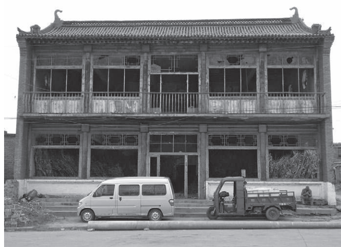
Figure 1. The abandoned restaurant, Kouquan, May 2016.

The diversity of functions of the shops and their rather large surfaces suggest that this place was "developed and prosperous" ( fada yu fanhua 發達與繁華). Kouquan is characterised by small lanes with abandoned self-built houses in various architectural styles, from the typical Shanxi-based yaodong (窯洞) dwellings – cave dwellings – to simpler village houses ( pingfang 平房) and yards as well as Buddhist temples.