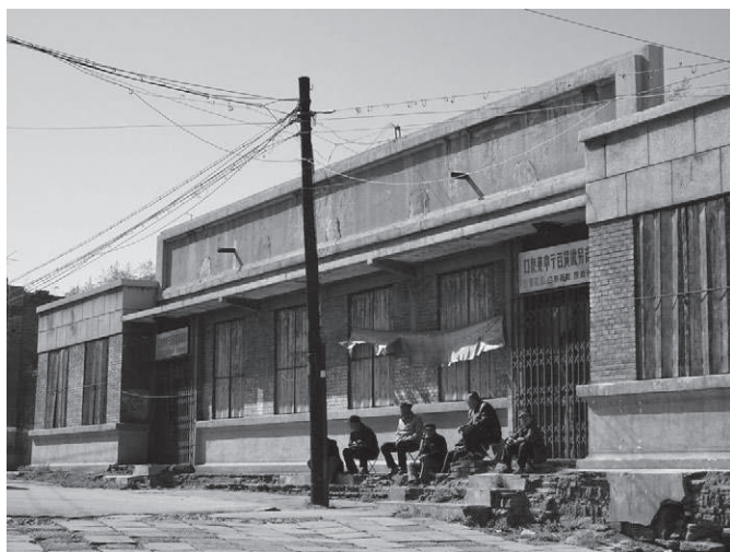
Figure 3. A group of elderly male residents sit on the threshold of a closed convenience store, Kouquan, May 2017.

Many of Kouquan's last residents feel "left-behind" (also noted in other contexts, e.g. Mah 2012: 7) witnessing the town fall into decay, in the context of a larger restructuring of the coal industry in Datong that created a lot of uncertainty and worry for families (Audin 2020). They also feel left-behind by the urban renewal programme: the relocation programme aiming to solve the problem of land-subsidence due to decades of aggressive industrial mining has not been fully implemented in Kouquan.