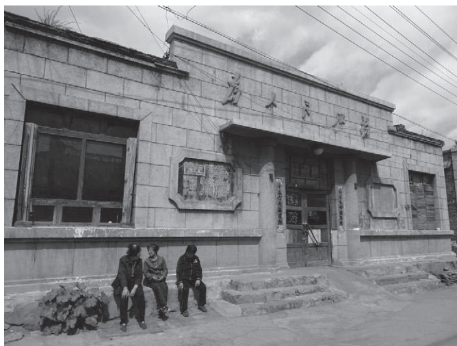
Figure 4. A group of elderly female residents spend time in front of the barber's shop, Kouquan, May 2018.

While the last residents are marginalised from urban lifestyles, ruination in Kouquan contributes to reinventing their local spatial practices, especially dwelling. Abandoned buildings offer a familiar space for the long-term community, with close-knit networks of people spending time chatting with one another. There is a close proximity between the residents and the abandoned buildings. Because their self-built houses are small, there is not much space available for gathering inside. Residents thus spend time sitting by the closed shop entrances (Figures 2, 3, and 4). Although there is a gendered division of space, typical of coal mining neighbourhoods, both groups of male residents and female residents use the abandoned buildings as their daytime meeting spots. Far from being avoided, the abandoned buildings provide new spaces for their daily discussions and games, hence the appropriation of porches with chairs, sofas, and stools.