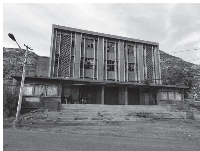
Figure 2. The Workers' Cultural Palace, Kouquan, June 2016. The Chinese characters "文化宮" ( wenhuagong , cultural palace) have faded away but still appear on the left side of the building.

Ruination in Kouquan Town is an important element of the uninhabited industrial space. I now explore the interactions between the residents and these abandoned buildings. In old Kouquan, there is still a residents' committee in charge of the population, two small barber's shops, one tomb maker and one shop for alcohol and tobacco ( yanjiu 煙酒). The employees told me that the population was shrinking because younger generations moved to other places in Datong or to other cities. Additionally, the last residents are not only retired miners but also farmers ( nongmin 農民) who