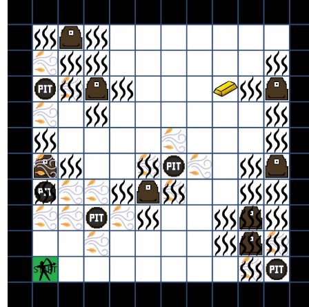
Figure 2: Screenshot from the game.

ontologies and to help the developer to know how to use them.