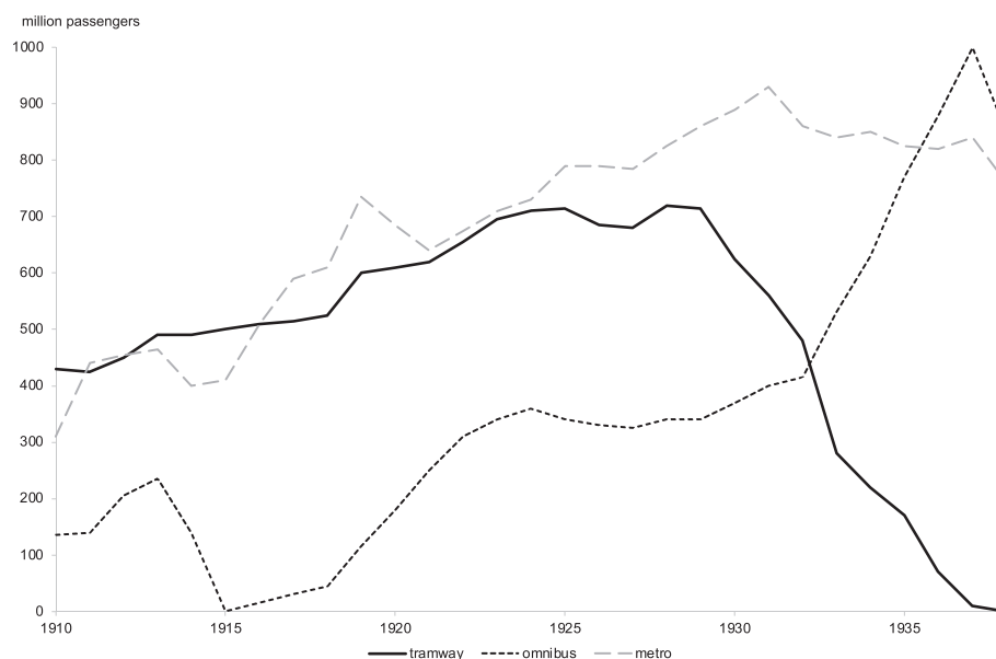
Fig. 2. Public transport passengers in Paris, 1910 to 1938.

The Compagnie Française pour l'exploitation des procédés Thomson-Houston—a French subsidiary of General