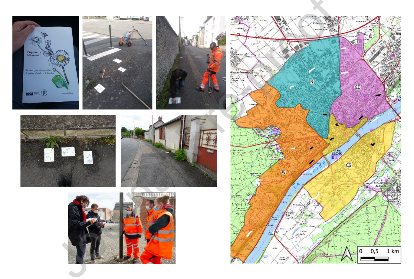
Figure 1. On the left, photographs of the experiment: [clockwise from top-left] one of the A5 stickers; stickers stuck to the street pavement and the thermal burner device used by the cleanliness service to weed streets; [Author 1] and one field operative of the cleanliness service affixing the stickers; stickers in situ ; one side of street in the experiment with stickers in place; [Author 4] and [Author 1] during a focus groups with three field operatives. On the right: map showing the four sectors of the cleanliness service of Blois (France) and the non-weeded streets in the experiment. In the black streets, interviews with pedestrians were conducted; in white streets, no interviews were

pedestrianized, with a high stake for the image of this area, considered as the showcase of the city by the municipality. Indeed, Blois is an important tourist city, with its castle and the Loire classified as a UNESCO heritage site. The rest of the city is mainly composed of residential pavilion areas. A large industrial area extends north of the city to the highway. Blois also has a very extensive neighborhood of collective residential buildings. The challenges of spontaneous vegetation management are different in these neighborhoods, which do not serve the same urban functions and are home to different socio-economic populations.