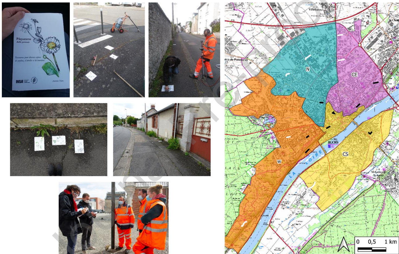
Figure 1. On the left, photographs of the experiment: [clockwise from top-left] one of the A5 stickers; stickers stuck to the street pavement and the thermal burner device used by the cleanliness service to weed streets; [Author 1] and one field operative of the cleanliness service affixing the stickers; stickers in situ ; one side of street in the experiment with stickers in place; [Author 4] and [Author 1] during a focus groups with three field operatives. On the right: map showing the four sectors of the cleanliness service of Blois (France) and the non-weeded streets in the experiment. In the black streets, interviews with pedestrians were conducted; in white streets, no interviews were

pedestrianized, with a high stake for the image of this area, considered as the showcase of the city by the municipality. Indeed, Blois is an important tourist city, with its castle and the Loire classified as a UNESCO heritage site. The rest of the city is mainly composed of residential pavilion areas. A large industrial area extends north of the city to the highway. Blois also has a very extensive neighborhood of collective residential buildings. The challenges of spontaneous vegetation management are different in these neighborhoods, which do not serve the same urban functions and are home to different socio-economic populations.