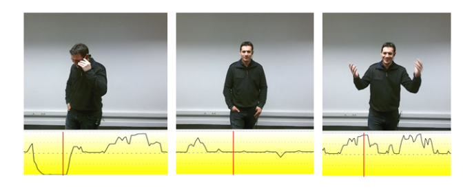
Figure 1: Snapshots of scenes of a participant in the NOXI corpus being disengaged (left), neutral (center) and highly engaged (right).