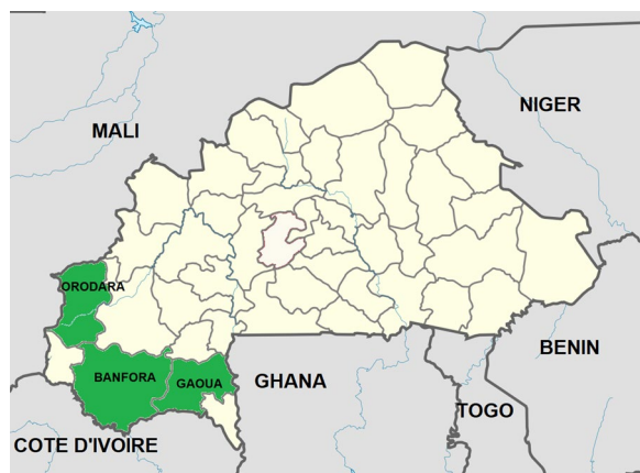
Fig. 1 Location of the study sites, Burkina Faso, 2022–2023

was part of a larger research project that aimed to investigate the prevalence of asymptomatic malaria using rapid diagnostic tests. Light microscopy-positive P. falciparum samples were used to assess deletion of the histidine-rich protein 2/3 gene.