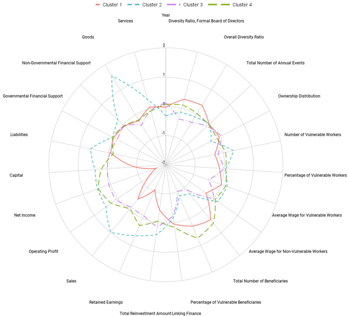
Fig. 1 Korean government-certified social enterprise cluster attributes

Thus far, there has been little explicit exploration of the semi-public sector hybrid SE subpopulations that have emerged as products of public sector entrepreneurship, which imbues this study with value as we provide empirical, population-level evidence of the diverse forms of GCSEs have assumed. We empirically demonstrate the types of SEs that may emerge in response to the state’s