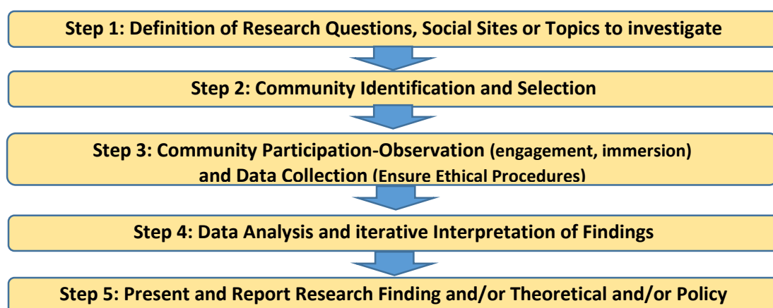
Figure N°1: Simplified procedure for a netnographic research project

In order to achieve a deep, comprehensive, and detailed understanding of a group of people, community, or society, the netnographic approach must be structured according to the procedures outlined by Kozinets (Fig. 1). The approach under consideration consists first in preparing the research by planning the fieldwork (Kozinets, 2010), where the researcher must define a clear and precise problematic. An identification of the virtual community to the object of study should be established by structuring and contextualizing the phenomenon being studied (Rabahi, 2020).