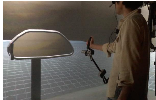
Figure 2. Example of the application in a CAVE system with a force feedback device.