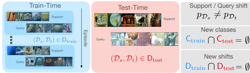
Fig. 2. During meta-learning (Train-Time), each episode contains a support and a query set sampled from different distributions (for instance, illustrated by noise and contrasts as in Figure 1(b)) from a set of training domains ( \mathcal{D}_{\text{train}} ), reflecting a situation that may potentially occur at test-time. When deployed, the FSL algorithm using a trained backbone is fed with a support set sampled from new classes. As the algorithm is subject to infer continuously on data subject to shift (Test-Time), we evaluate the algorithm on data with an unknown shift ( \mathcal{D}_{\text{test}} ). Importantly, both classes ( \mathcal{C}_{\text{train}} \cap \mathcal{C}_{\text{test}} = \emptyset ) and shifts ( \mathcal{D}_{\text{train}} \cap \mathcal{D}_{\text{test}} = \emptyset ) are not seen during training, making the FSQS a challenging problem of generalization.

Few-Shot Learning under Support-Query Shift (FSQS). Given: