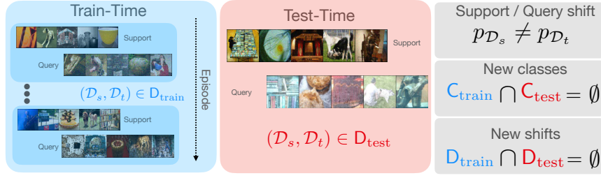
Fig. 2. During meta-learning (Train-Time), each episode contains a support and a query set sampled from different distributions (for instance, illustrated by noise and contrasts as in Figure 1(b)) from a set of training domains ( \mathbf{D}_{\text{train}} ), reflecting a situation that may potentially occurs at test-time. When deployed, the FSL algorithm using a trained backbone is fed with a support set sampled from new classes. As the algorithm is subject to infer continuously on data subject to shift (Test-Time), we evaluate the algorithm on data with an unknown shift ( \mathbf{D}_{\text{test}} ). Importantly, both classes ( \mathcal{C}_{\text{train}} \cap \mathcal{C}_{\text{test}} = \emptyset ) and shifts ( \mathbf{D}_{\text{train}} \cap \mathbf{D}_{\text{test}} = \emptyset ) are not seen during training, making the FSQS a challenging problem of generalization.

Few-Shot Learning under Support-Query Shift (FSQS). Given: