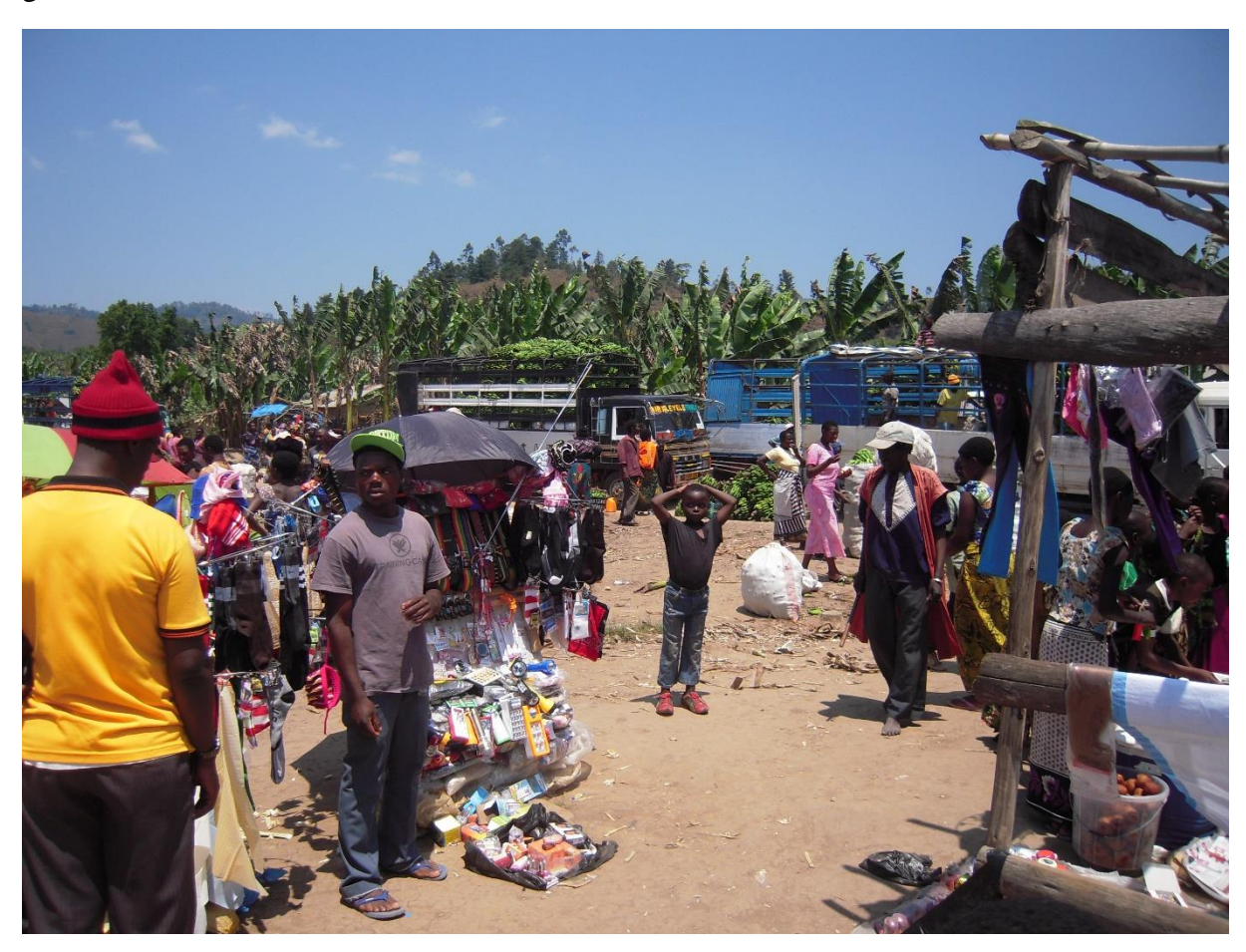
Figure 2. Ibililo market: the crossroads of old and more recent trade routes (Author 2014)

trade route for bananas, which reaches as far as Dar es Salaam or Gaborone. The market is also connected to the trade route for Chinese goods, acting as a local hub in a rural branch of a transnational network. Rural markets mirror both their hinterland and the contextualised globalisation.