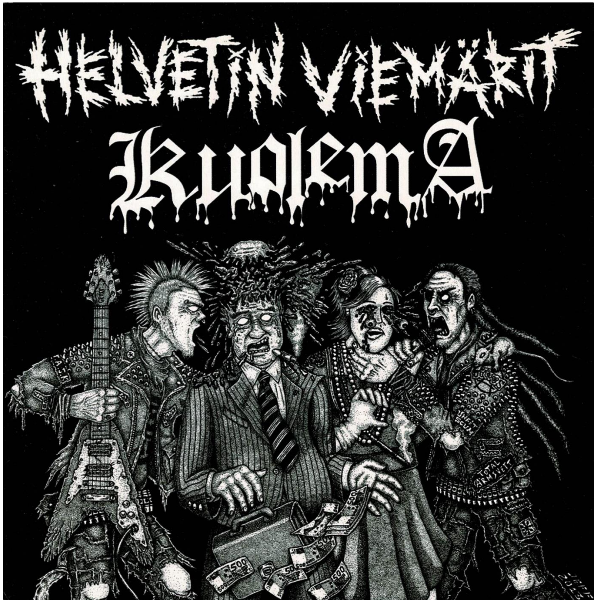
FIGURE 1 For this split 7", Helvetin Viemärit teamed up with Finnish hardcore legends Kuolema.

In the case of Brazil, it is very clear that Finnish hardcore played a part in influencing the local punk scene, however, that does not mean that Brazilian hardcore would sound, or even aim to sound the same. The influence goes beyond music itself for example to “philosophies” of punk music production, and the attitude of not caring about musical precariousness but rather embracing it. Although this attitude can certainly be felt in some Finnish groups, it was also innate to the early groups from Brazil. At all accounts, that the Finns also subscribed to this attitude would have been inspirational to some Brazilians in the following decades. They were still experiencing similar challenges as some of the Finnish hardcore punks in the early 1980s: lack of spaces to practice, lack of spaces to perform, lack of access to musical education and equipment. One Brazilian interviewee (Ullvén 2016) used the example of the precariousness of the Finnish group Sorto to make the