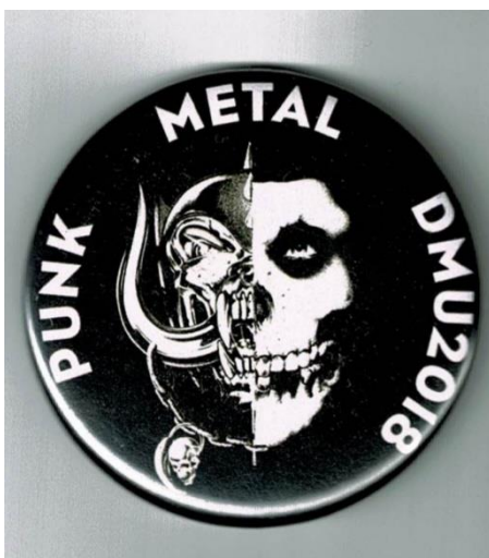
FIGURE 3 The conference organisers from the Punk Scholars Network had made pins for the event.