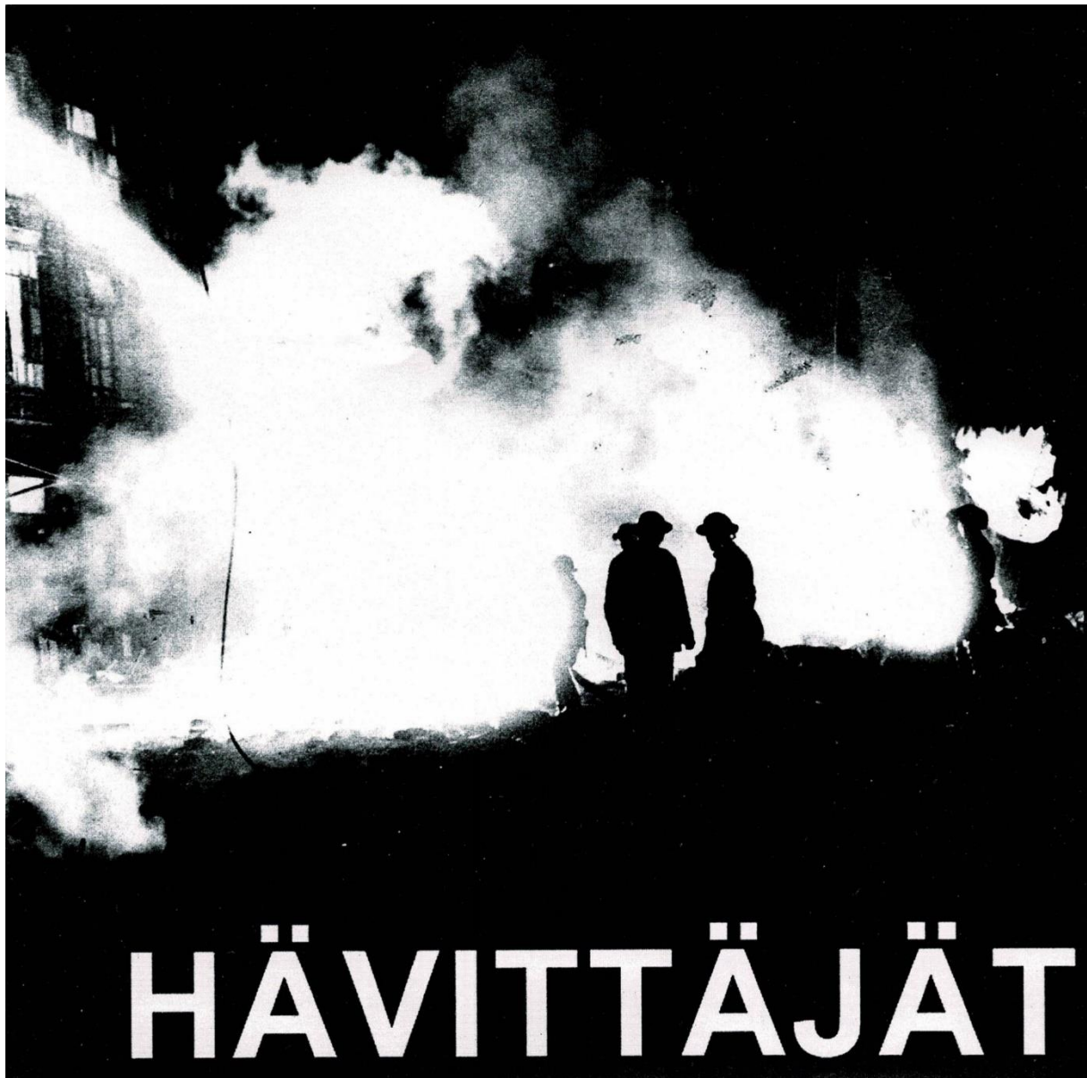
FIGURE 2 Members of the Australian group Hävittäjät have no ethnic ties to Finland, nevertheless they have opted to sing in the Finnish language.

Due to my personal involvement in the punk scene, I opted to use autoethnography as a part of my research methodology, however, hopefully not to the point of ‘diary disease’ (Bourdieu 2003), but just enough for it to be clear that I am not trying to come off as a neutral observer (if such a person exists). In addition, my personal experience was important in the following ways: having previously played in the countries was helpful, both in acquiring the necessary contacts, as well as already having an idea about the local scenes. Another punk-inspired decision I made was not to use Facebook (fb punx, fb punx, fb punx - f-off!), or other social media, to seek information, attract