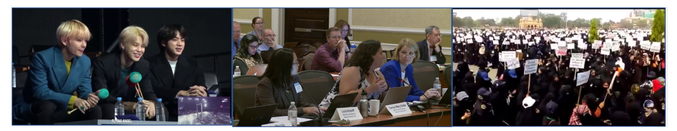
Figure 1: Examples from the VGAF dataset. From left to right, examples of Positive, Neutral, and Negative classes.

<sup>1</sup> Univ. Grenoble Alpes, CNRS, Grenoble INP, LIG, 38000 Grenoble, France <sup>□</sup> <sup>1</sup> Univ. Grenoble Alpes, CNRS, LJK, 38000 Grenoble, France <sup>□</sup>