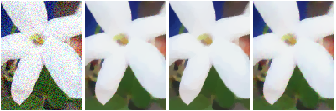
Figure 3: Detail of Figure 2

f \in BV(\Omega, [0, 1]^3) . However, being obtained by adding a small amplitude noise to a bounded variation function, we may expect that the set \tilde{J}_f of Section 7 corresponds to the set of (large enough) edges in the original image.