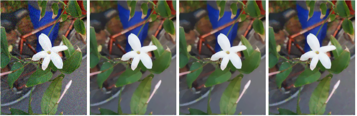
Figure 2: A noisy image and the denoised versions with, respectively, the Frobenius ROF, Nuclear ROF, Spectral ROF problems.

We solved here the “ROF” problem (1) for a data term given by a noisy color image, and the Frobenius, Nuclear and Spectral total variations. Figure 2 shows the results, which look almost identical. The close-up in Figure 3 seems to show that the edges are better recovered with the Nuclear total variation, and quite jagged in the case of the Spectral total variation, for which the jump inclusion might not hold. Of course, this is a discrete experiment at a fixed scale and therefore a relatively poor illustration of our main results. Observe that in these experiments, one cannot expect that the original datum (left image) represents a function