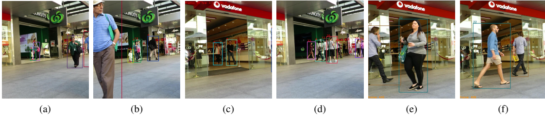
Figure 1: Examples of issues faced by the discussed algorithms. (a) and (b) visualize output of ByteTrack [6], (c) and (d) of BoT-SORT [1], and (e) and (f) of SUSHI [2]. The presented sequence comes from the MOT17 dataset [5]. Best viewed digitally.

it does not access the future frames while processing the current one. It uses a strong and robust object detector, YOLOX [4] which is pre-trained on a MOT dataset of interest. During the association process between the existing tracklets and new detections, ByteTrack considers bounding boxes with both high and low confidence scores so as to recover occluded objects. It predicts next locations of the tracks with Kalman Filter and associates them with the new bounding boxes based the intersection over union (IoU) metrics. It is a well-engineered algorithm with robust tracklet management system. It servers as a very good baseline without any association learning scheme or visual cues.