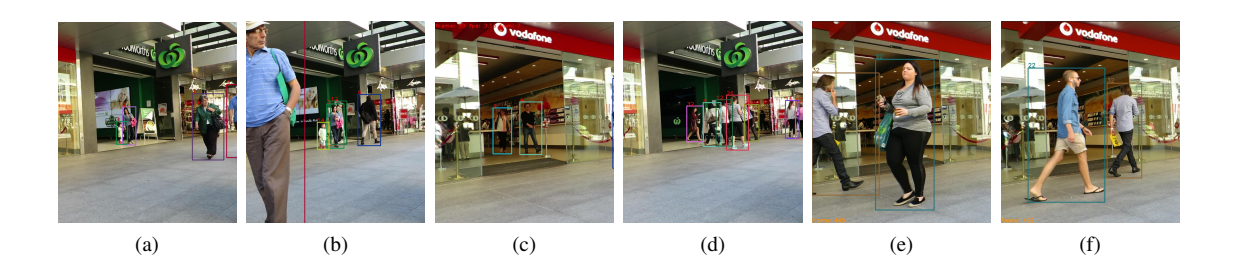
Figure 1: Examples of issues faced by the discussed algorithms. (a) and (b) visualize output of ByteTrack [6], (c) and (d) of BoT-SORT [1], and (e) and (f) of SUSHI [2]. The presented sequence comes from the MOT17 dataset [5]. Best viewed digitally.

it does not access the future frames while processing the current one. It uses a strong and robust object detector, YOLOX [4] which is pre-trained on a MOT dataset of interest. During the association process between the existing tracklets and new detections, ByteTrack considers bounding boxes with both high and low confidence scores so as to recover occluded objects. It predicts next locations of the tracks with Kalman Filter and associates them with the new bounding boxes based the intersection over union (IoU) metrics. It is a well-engineered algorithm with robust tracklet management system. It servers as a very good baseline without any association learning scheme or visual cues.