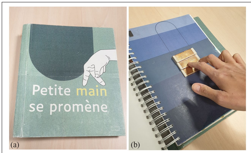
Figure 2. Book cover (a) and Page 1 of the multimodal book (b).

Follow this link to see a demo video of the multimodal book: https://drive.google.com/file/d/1he7izTbq69dTENLSmE8SxavvB1uy7Fpd/view?usp=sharing .