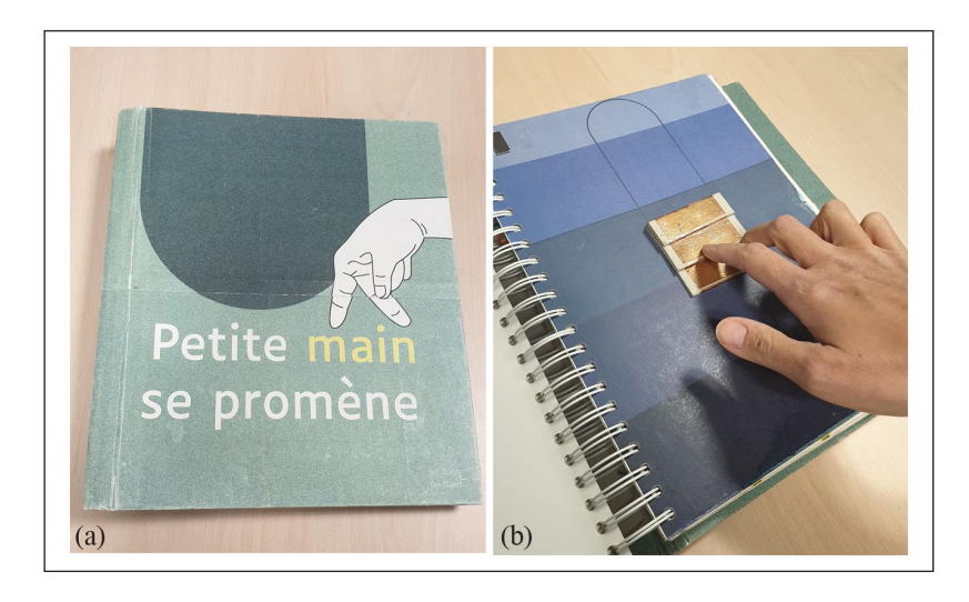
Figure 2. Book cover (a) and Page 1 of the multimodal book (b). Follow this link to see a demo video of the multimodal book: https://drive.google.com/file/d/1he7izTbq69dTENLSmE8Sx avvB1uy7Fpd/view?usp=sharing.

This allowed the children to hear different sounds in response to their tactile exploration of the book. Thus, they had a direct sound response depending on the elements they were exploring on the page, and they could hear instructions on each page that were written as well. In this version of the prototype, the text was only transmitted by a voice-over. Figure 1 presents technical components of the multimodal book.