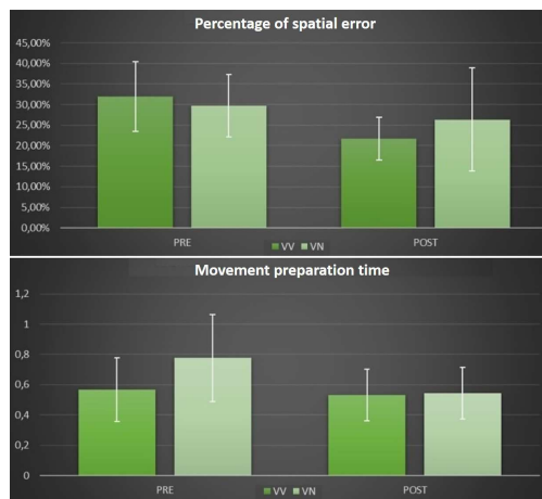
Figure 2. Percentage of spatial error and Movement preparation time obtained in the conditions with vibration and vision (VV) and with vibration and no vision (VN).

Two dependent variables were computed: Percentage of spatial error and Movement preparation time. Repeated measures ANOVAs were conducted on these two dependent variables with the factors Learning (pre-test versus post-test) and Visual condition (with vision versus without vision during the learning phase). Regarding the Percentage of spatial error, the analysis showed a significant effect of Visual condition [F (1, 22): 10.63, p < 0.01 ], no effect of Learning, and no significant interaction between these two factors (both p > 0.05 ). Regarding Movement preparation time, the analysis showed a significant effect of Learning [F (1, 22): 5.22, p < 0.05 ], no effect of vision, and no significant