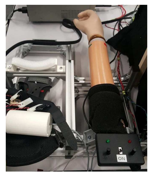
Figure 1. Image of the experimental set-up

Materials . The materials consisted of a prosthetic arm and a vibro-tactile bracelet. In order to control the prosthesis, two cutaneous electrodes, with an acquisition frequency of 10 Hertz, were used to receive the electromyographic signals. The electrodes were placed on two muscles on the participants' arm: the flexor and the extensor. Whenever there was a muscle contraction, signals were generated, filtered, and amplified inside the electrode. The tactile feedback was given through a bracelet made of scratch on which 6 vibrators (Haptuator Mark II, Tactile Labs, Montreal, Canada) were equidistantly located, so that they were separated by a 30^{\circ} angle (see Fig. 1).