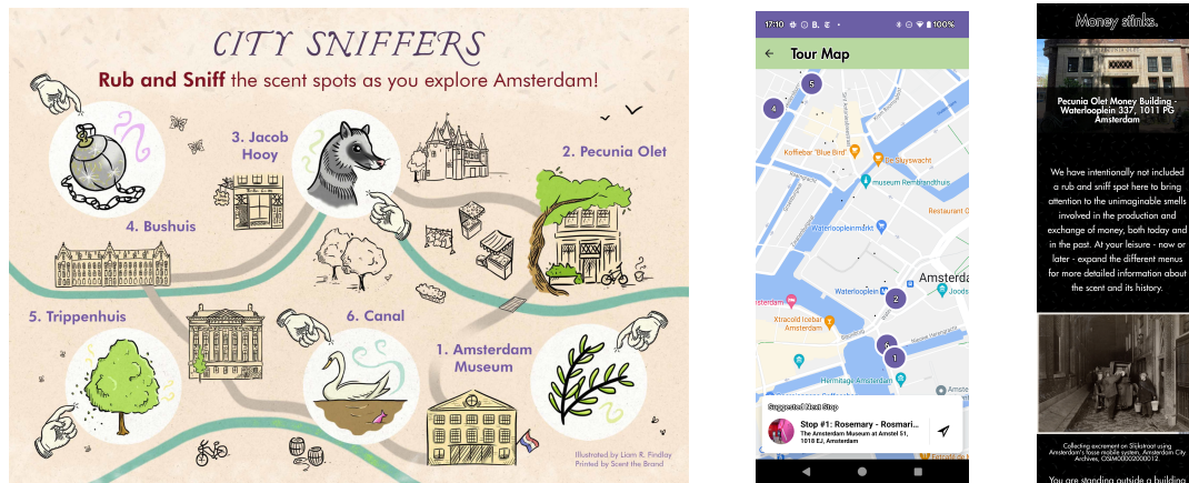
(a) 'Rub'n'Sniff' map created for Odeuropa's, City Sniffers- (b) Screen shot of the City (c) Screen A smell tour of Amsterdam's ecohistory , printed for the Sniffers application shot of the City event by Scent the Brand. Designed by Liam R. Findlay. (map). Sniffers application Note: the numbers indicate the order of stops. (stop 2).