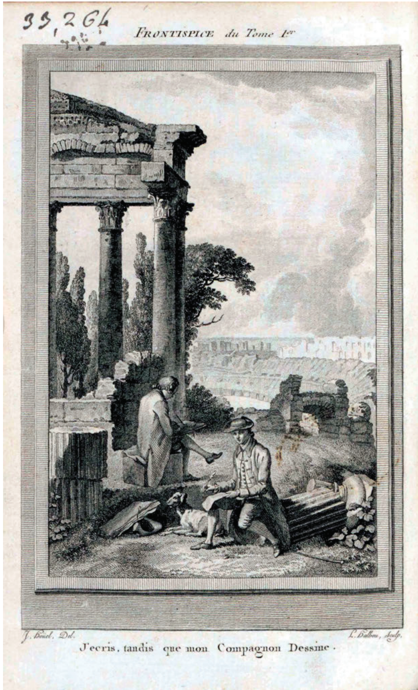
Fig. 5: Jean Houël, “J’écris, tandis que mon compagnon dessine,” frontispiece, engraving, in: Pierre-Augustin Guys, Voyage littéraire de la Grèce (Paris: Veuve Duchesne, 1783), Bibliothèque Méjanès, Aix-en-Provence