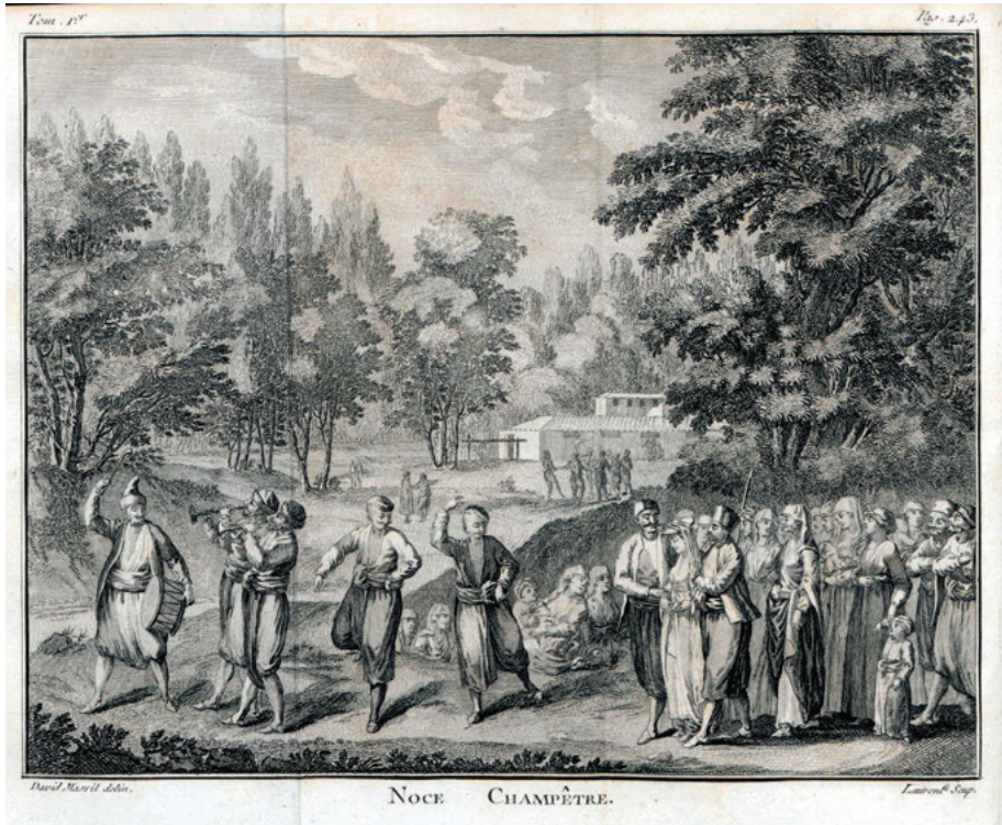
Fig. 3: David de Marseille, “Noce champêtre,” engraving, in: Pierre-Augustin Guys, Voyage littéraire de la Grèce , vol. 1 (Paris: Veuve Duchesne, 1783) Pl. 13, Bibliothèque Méjanes, Aix-en-Provence

of Ottoman women, 49 to genre scenes ( Noce champêtre ; Pleurs sur les tombeaux ), and then to images of monuments such as the Fontaine de Saint-Élie , or the section, elevation, and plan of an aqueduct (Bourgas), with varying formats taking up a full page or pages that fold out (fig. 3 and 4). Finally, no significant “antiquities” are illustrated, but it is also true that the text does not deal with the heart of ancient Greece.