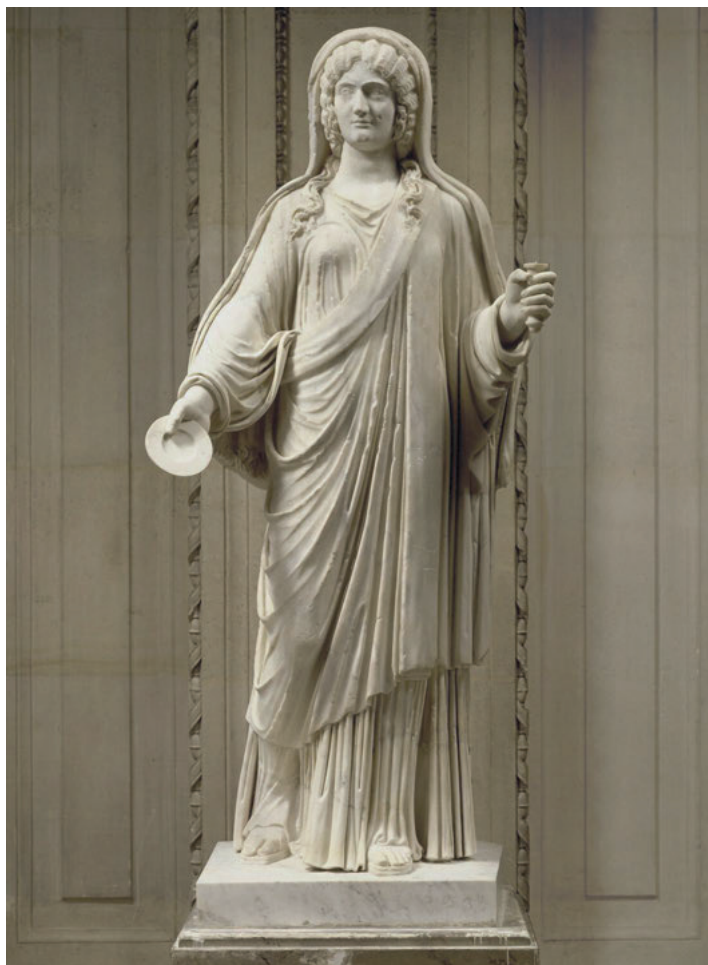
Fig. 2: Unknown artist, Julia Domna , ca. 193/209 CE, marble, 202 x 72 x 47 cm, Musée du Louvre, Paris, inv. no. LL 36