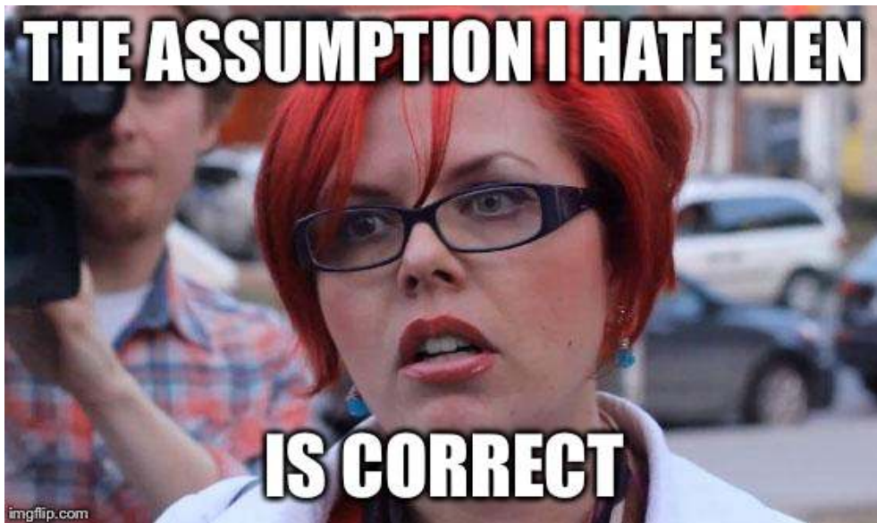
Figure 3. "Big Red; The Assumption I Hate Men Is Correct." Know Your Meme , 2014