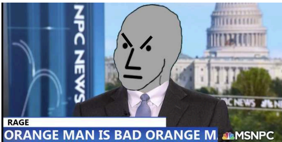
Figure 6. "Orange Man Bad – NPC Rage." Know Your Meme , 2018