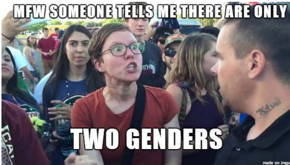
Figure 4. “Triggered Feminist/Ficki Fiona; MFW [My Face When] Someone Tells Me There Are Only Two Genders.” Know Your Meme , 2016