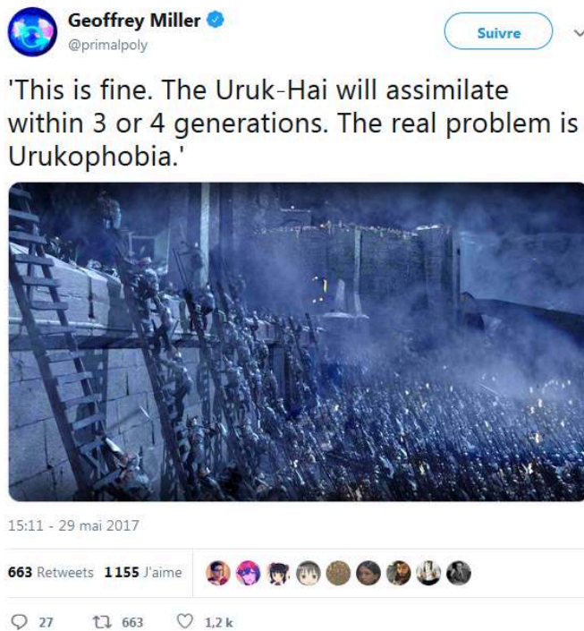
Figure 2. Tweet by Geoffrey Miller (May 29, 2017)