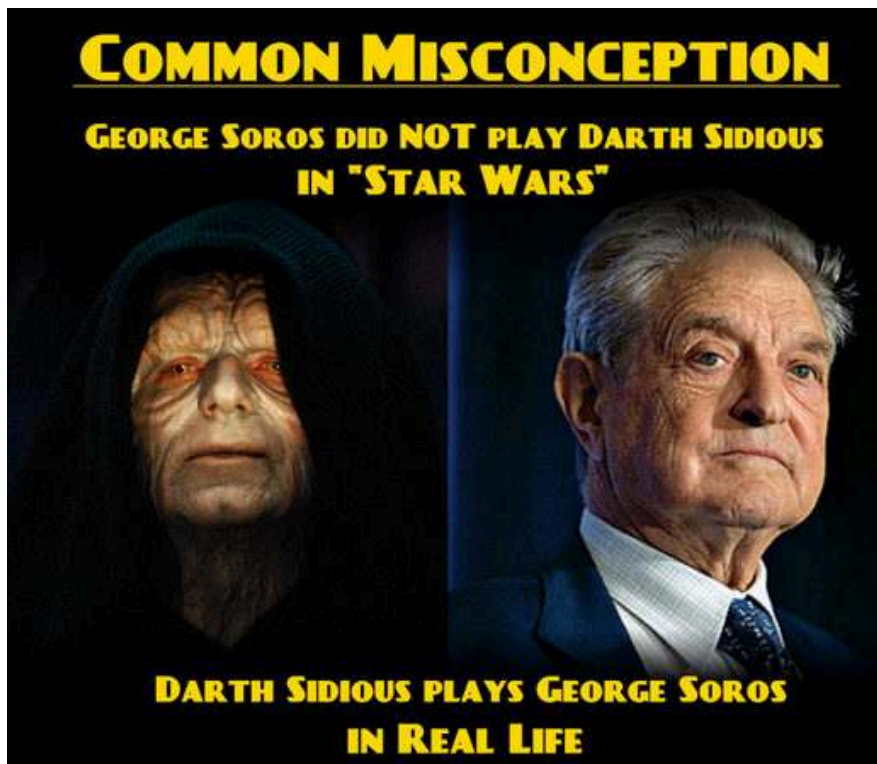
Figure 7. "George Soros/Darth Sidious." SOTT.net.

Source: https://www.sott.net/image/s19/390237/large/george_soros_darth_sidious.jpg