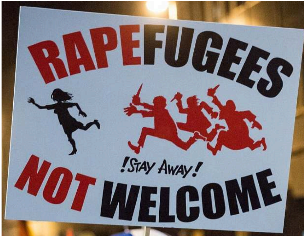
Figure 1. Rapefugees Not Welcome