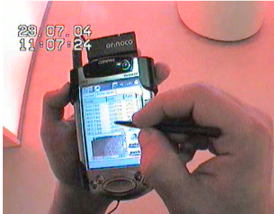
Figure 3. User's "subjective" viewpoint.

especially the manipulation of this device. This information completes the data collected via the automatic logger, and facilitates the analysis of the raw data in the log files.