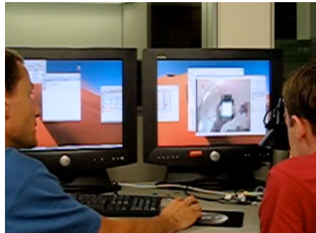
Figure 5. A self-confrontation session

The contextual and subjective views provide an audiovisual support in order to conduct self-confrontation interviews with the users (figure 2).