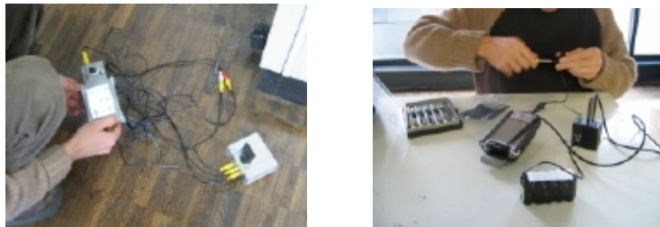
Figure 4. The wireless video-recording system (which actually still requires some wires between the handset and the wireless emitter...).

The micro-camera contains a microphone that provides sound information about the surrounding environment, specifically: the vocal interaction with the speech recognition module of the multimodal application, the interaction with other agents, and the ambient environment in which the activity takes place. The audio-video data are directly recorded and compressed in DivX format in a blow on a portable hard-disk (Archos TM ). The user carries the hard disk and a set of batteries in a backpack. In a variation of this basic configuration, the audio-video stream is directly transmitted via a wireless emitter to a remote receiver (figure 4).