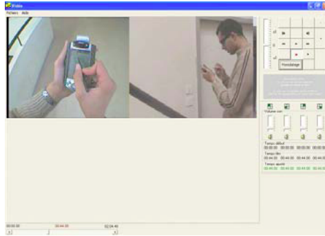
Figure 6. The Actogram TM data analysis tool.

The different events (including the users' actions) were coded in three categories in order to describe the contextual dimensions of the situated activities. We draw inspiration here from the distinction introduced by Quéré between “environment”, “context” and “situation” (Quéré, 1997). In our study the “environment” refers to the surrounding physical properties (light, noise, physical arrangement of the space,) that may play a role in the selection and use of the available interactive modalities. These properties are identified and coded by the experimenter when repeatedly viewing the videotapes (contextual view). The “context” refers to the features that can give sense to a particular action: the type of activity that the user is engaged in at a given moment (e.g. interaction with the device, information acquisition, motion management, etc.), the historical dynamics of the user's course of action (e.g. incidental sequence, interaction episode with the other player, interaction with other actors, etc;). The viewing of the tapes, combined with information from the log files, is used to code these contextual elements. The “situation” addresses directly the experience of the user and subsequently the dynamics of his/her commitment in action at a given moment. This level of analysis, which requires a description of the activity from the user's point of view, is based on the self-confrontation reports.