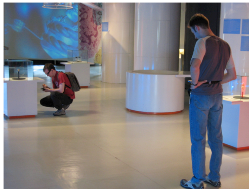
Figure 2. Unobtrusively shadowing the user : the experimenter follows the user with a camcorder.

A limitation with the fixed cameras is their lack of flexibility: there is one single viewpoint on the situation and it cannot be dynamically changed. On the other hand an experimenter following the user with a video camera can adjust in real-time the centring in order to have the more relevant viewpoint at a given time. A drawback with this approach is that different experimenters will not behave uniformly when following and recording the users. Ideally, it would be better to have the same experimenter recording all of the experimental sessions throughout the study.