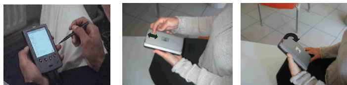
Figure 1 : The tactile, gestural and tangible modalities

Only the tactile modality was really implemented ; the other modalities were simulated by the WoZ setup.