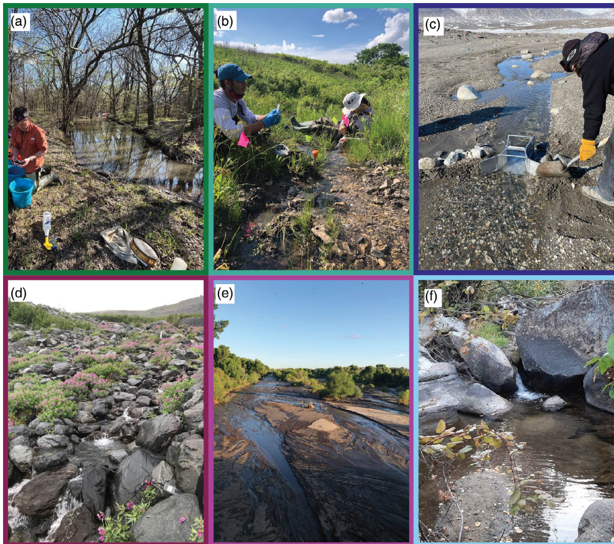
Fig. 2. Photos of different low-flow conditions that lead to difficulty implementing established discharge methods. The colors outlining each photo corresponds to a box in the decision support tool. (A) Slackwater with no visible flow, Blue River headwaters, Oklahoma, photo: Amy Burgin. (B) Stage less than 10 cm deep, South Fork of King's Creek headwaters (subwatershed N02B), Kansas, photo: Amy Burgin. (C) A channel that can be modified to use a portable flume, Bohner Creek, McMurdo Dry Valleys, Antarctica, photo: Anna Wright (D) Large substrate leading to bed elevation variability greater than 50% of channel depth, tributary to Wolverine Creek, Alaska, photo: Hannah Richardson. (E) Threaded channels, Hassayampa River, Arizona, photo: Raphael Mazor. (F) A natural constriction in a channel suitable for using a bucket method, Dry Creek, Idaho, photo: Mac Beers.

used but may take hours to days, rather than minutes to an hour required at moderate to high flow conditions. In addition, dilution gaging at low flows often results in non-optimal breakthrough curves from incomplete mixing that are not suitable for discharge estimates. Portable flumes/weirs are faster to implement but require modifying the channel, for example manually creating berms to concentrate flow through a flume (Fig. 2C), which may not be possible for many reasons. While the DST provides recommendations for general categories of measurement methods, further modifications of each method can help accommodate specific flow conditions (e.g., different variations on the application of