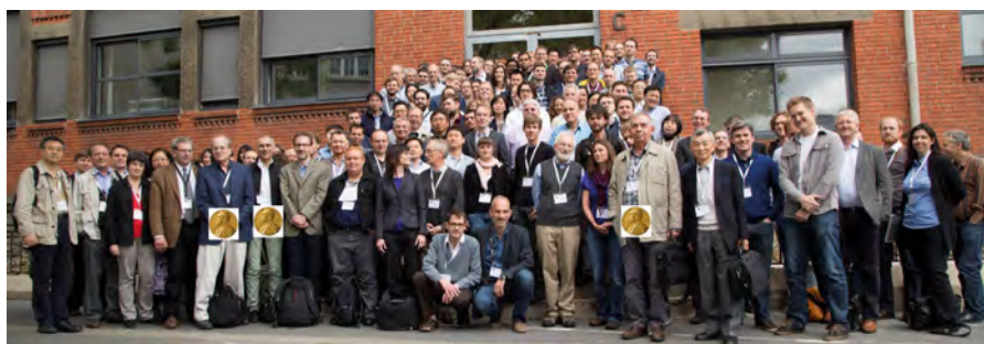
Figure 1. Group photo from the Conference “30 Years of Colloidal Quantum Dots” taken during the 2014 conference held at ESPCI to celebrate the 30th anniversary of quantum dots. The three 2023 Nobel Prize laureates’ are highlighted with medals.