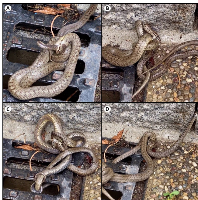
Figure 1. Attempted predation of an adult female smooth snake ( Coronella austriaca ) by an adult male – A. The male initiates the attack by grabbing the female in the tail area, B. Then in the middle of the body, C. In defence the female bites the male, and D. The female finally escapes (see BHS video, 2023a)

On 4 July 2023 at 19:50 h on a pedestrian path on the edge of the forest in Medeglia, Switzerland (46° 06'57" N 8° 58'09" E), two snakes were observed. It was a stormy day, the sky was periodically very cloudy, without wind, and temperatures approx. 18° C. The largest snake (approx. 60 cm) was biting near the neck of the second smaller snake (approx. 40 cm), probably trying to swallow it (Fig. 2). The victim coiled and squirmed, moving its tail rapidly in response to the attack, trying to free and defend itself (BHS Video, 2023b). As the snakes were on a path that was frequented by people and dogs the observer