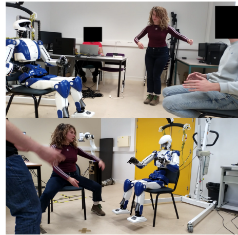
Fig. 2. Still from the HRP-4 experiments. Imitation phase above and improvisation phase below

In the first preliminary experiment, we recruited 25 French participants (24 females and 1 male) from a dance class at Lycee La Mercy in Montpellier. The experiment took place in November 2022. The mean age of the participants was 16.44 (SD=0.58, MD=16). The participants had a group experience of HRI, during a collective dance training session. We prepared three video sequences of one minute each where a series of gestures was executed, following the same order. The 25 participating students were instructed to imitate and then improvise with the virtual versions of an industrial (Franka) and a humanoid robot (HRP-4), see Figure 1. We asked them to collectively imitate each sequence in the following order: human, industrial robot and a humanoid robot. Once this imitation process occurred, we switched off the projection and asked the participants to collectively improvise using the gestures learnt during the video trials. The improvisation lasted for about 15 minutes and at their demand, we used recorded music to enhance expressive states. Videos of this experiment are available online ( https://vimeo.com/779347404 and https://vimeo.com/779363288 ). At the end of this process,