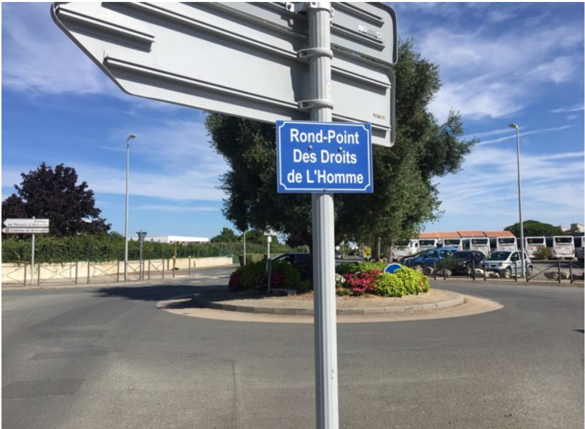
Table 2. Logistic regression models on funding for NGOs and ratification of legal texts