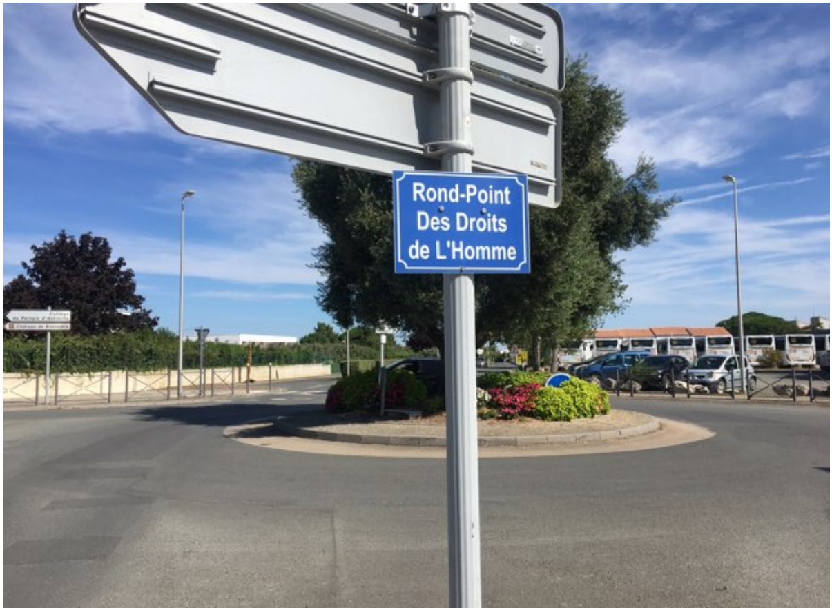
Table 2. Logistic regression models on funding for NGOs and ratification of legal texts