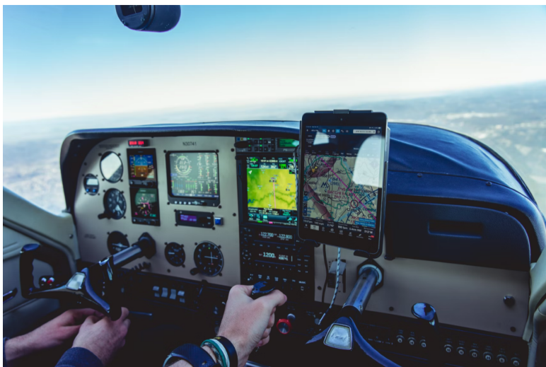
Figure 1: A consumer tablet with a navigation app is usually the most advanced technology support that general aviation pilots have.

pilots require to log for maintaining their flight permissions. In the US for example, GA pilots are only required to take a biennial flight review to maintain their privileges [8]. They are not obliged to spend more time in the air. In addition, GA planes, often single-piston aircraft with two to six seats and an average age of 38 years [3] in the US, are still a major part of the worldwide GA fleet. In many cases, a moving map on a tablet, as shown in Figure 1, strapped to the pilot's leg or attached inside the cockpit is the only digital flight support that GA pilots get in their single-pilot operations [9]. Yet, the interaction with such devices in the GA aircraft is heavily limited for several reasons: (1) the noisy environment renders voice interaction ineffective; (2) shaky and turbulent operations in small aircraft impact the efficiency of touch interactions; (3) consumer tablet screens are difficult to read in bright sunlight, especially in the air; and (4) two-dimensional displays fail to render the full spectrum of information present in the three-dimensional maneuvering space.