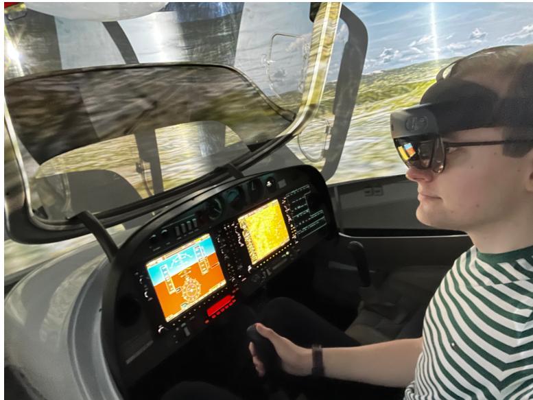
Figure 2: Picture of a pilot who tests the interaction with augmented en-route flight information through a mixed reality headset in a high-fidelity Diamond DA 40 simulator.

even more limited: not only is voice interaction not an option, mixed reality headsets do not offer a touchscreen, and gaze and gesture control have shown to be inefficient.