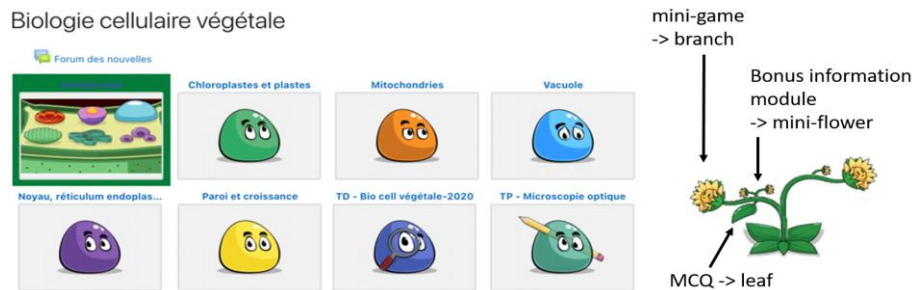
Fig. 3. Integration of the game to the e-learning platform