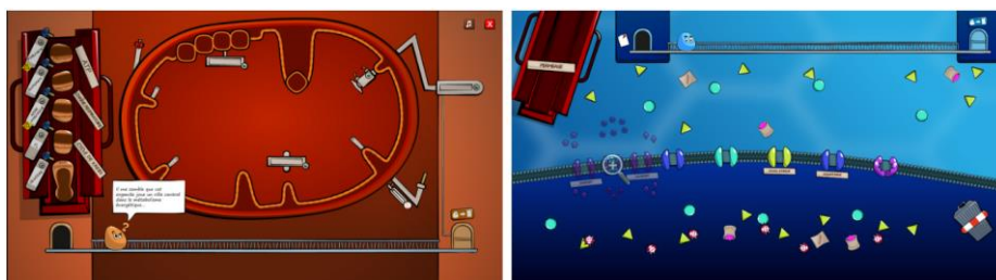
Fig. 2. Mini-game 2 - Mission respiration and Mini-game 3 - Vacuole commando

explanations to help the students throughout their mission ( e.g. , “it is too dark in here” to encourage students to switch on the light button that is necessary for photosynthesis). As students complete the scene, Blob moves forward on the bridge to materialize their progression. When the scene is complete, an animation shows the photosynthesis process which converts light into chemical energy that is then stored in organic compounds and releases gas. Three bonus information modules are hidden in the game. They provide extra information about the photosynthesis process. These modules can be unlocked by clicking on specific parts of the scene ( e.g. , lever and battery on the topright of the first picture of Figure 1). Similar mini-games were created for chapters 2 and 3 (Figure 2). The mini-games for the last two chapters were designed but are not yet fully developed.