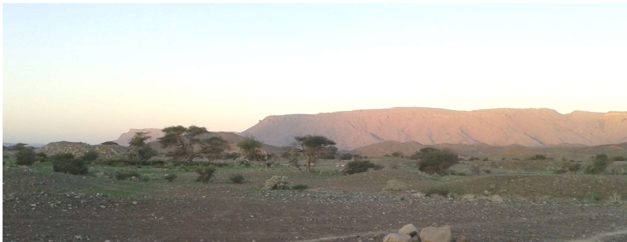
Fig. 1: Bat/At-Arid site general view, © archaeological Mission Bat/al-Arid. C. Castel.