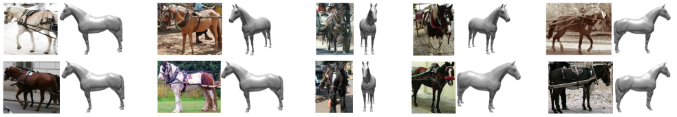
Figure 3: Visual results of pose estimation on horse images from ImageNet [3] using models from Free3D [7]. We rank the prediction for each orientation bin by the network prediction and show the first (best) results for various poses.