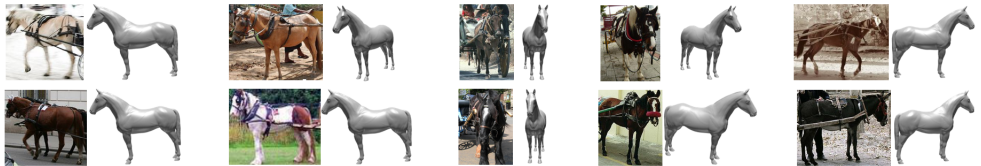
Figure 3: Visual results of pose estimation on horse images from ImageNet [3] using models from Free3D [7]. We rank the prediction for each orientation bin by the network prediction and show the first (best) results for various poses.