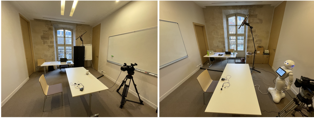
Figure 2: Interview rooms 1 (smart speaker) and 2 (Pepper robot)