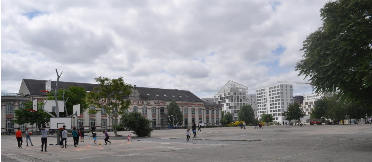
Figure 1. Economic development on the site of Ile-de-Nantes through the conversion of industrial remnants into industrial museums and the construction of residential and office buildings.