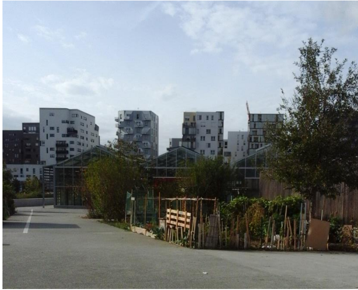
Figure 3. Economic development on the site of Docks-de-Seine through the conversion of industrial remnants into exhibition spaces and the construction of residential and office buildings. ©Author, 2023.