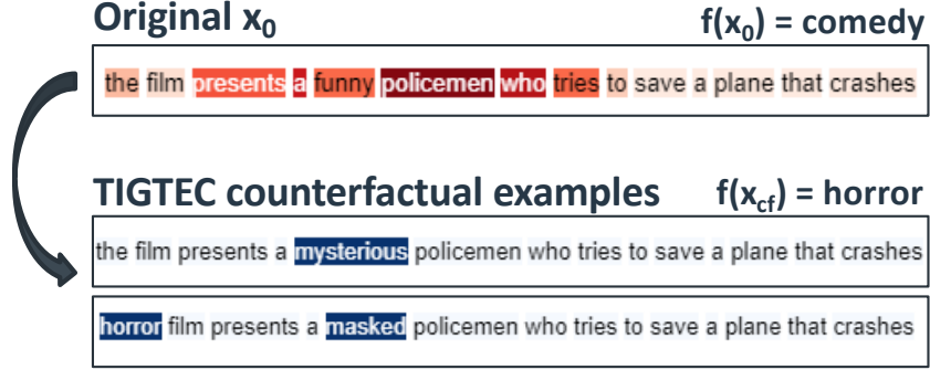
Fig. 1. Example of sparse , plausible and diverse counterfactual examples generated by TIGTEC for a film genre classifier that discriminates between horror and comedy synopses. Here, the counterfactual generation goes from comedy to horror.

textual semantic distance to preserve the initial content is introduced, (iv) the solution space is explored with a new tree search policy based on beam search that leads to diversity in the generated explanations. In this manner, TIGTEC bridges the gap between local feature importance, mask language models, sentence embedding and counterfactual explanations. TIGTEC can be applied to any NLP classifier in a model-specific or model-agnostic fashion, depending on the local feature importance method employed.