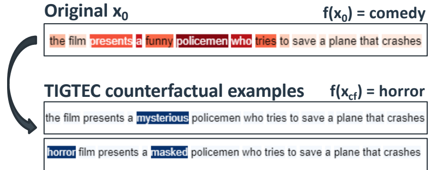
Fig. 1. Example of sparse , plausible and diverse counterfactual examples generated by TIGTEC for a film genre classifier that discriminates between horror and comedy synopses. Here, the counterfactual generation goes from comedy to horror.

textual semantic distance to preserve the initial content is introduced, (iv) the solution space is explored with a new tree search policy based on beam search that leads to diversity in the generated explanations. In this manner, TIGTEC bridges the gap between local feature importance, mask language models, sentence embedding and counterfactual explanations. TIGTEC can be applied to any NLP classifier in a model-specific or model-agnostic fashion, depending on the local feature importance method employed.