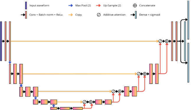
Figure 1. Illustration of the proposed waveform decomposition network architecture.

Additive attention, as introduced in [19], is used to better pass information about the waveform across the network and allow the model to focus on features from different representation spaces in the decoder, thereby reconstructing waveform components more effectively. Using this setup, each sample of the decoder layer attends to each sample of the corresponding encoder layer.