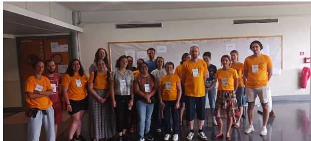
Figure 0.2: The organizing committee and volunteers