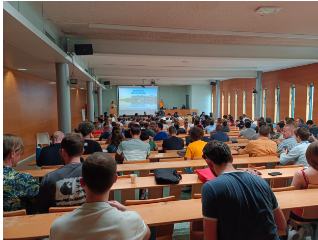
Figure 0.1: Rencontres R 2023 Opening