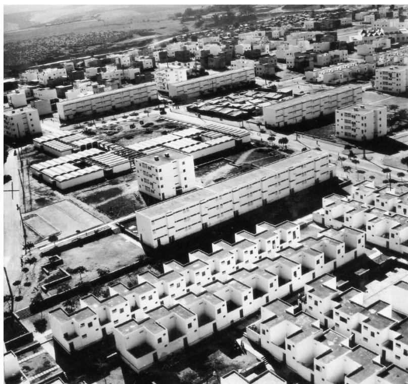
Figure 3. Rabat, Cité Yousoufia. In foreground the urban fabric, beside the central square with collective housing and the market

A further urban complexity, in accordance with the same theme of base grids and cells disposition, has been proposed in the unrealized proposal for Sidi Othman in Casablanca by John Hentsch and André Studer (1954). The project introduces cells superposition, towards a more sophisticated urban morphology. It prefigures a Modern casbah , in which the patio units overlap to create a three-dimensional fabric that amplifies the richness of open spaces experience.