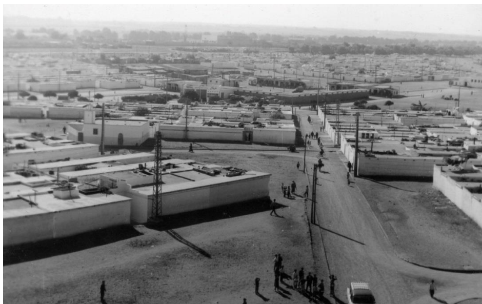
Figure 2. Michel Ecochard, Horizontal fabrics in Cité Yacoub el Mansour, Rabat, 1948

The projects of Cité horizontale take such structural logic as their guiding path. The patio cells are installed on 8-meters-wide square grid, that infrastructures the territory and constitutes the metric element. However, cells juxtaposition is not in series but in clusters: vehicular roads define the perimeter of neighbourhood units, dense, pedestrian fabrics, structured around a centre with proximity services. Inside the fabrics, open space is hierarchized in a progression that follows the organizational structure of the medina. Crossing alleys are reduced in section towards residential sectors. These in turn expand into squares for proximity relations and life, on which open impasses leading to the domestic space of the patio. Hence, open space is structured in several orders: circulation and collective services, neighbourhood spaces, proximity areas and domestic patios. This progression matches, morphologically and organizationally, use and perception codes of traditional settlements, offering a frame measured on human scale and calibrated on local habits.