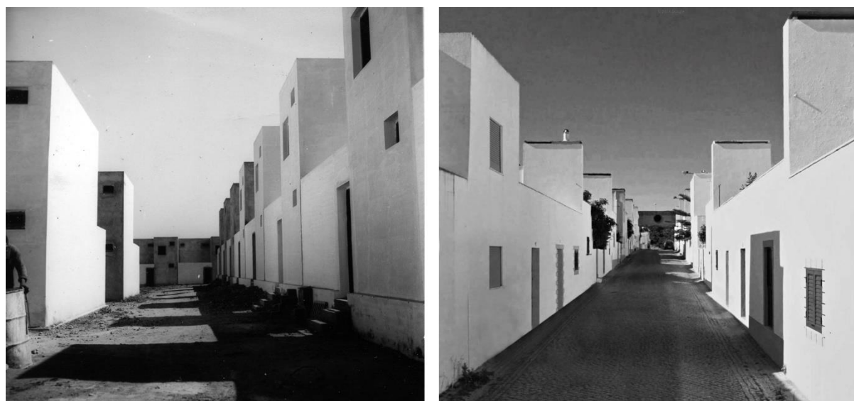
Figure 4. Left: Cité Youssoufia in Rabat. Right: A. Siza, Quinta da Malaqueira, Evora. Probably there are no direct relations between the two projects, however visual link testifies how similar methods and tools produce similar results

Siza is the last voice of the chorus of the Modern. He embodies its principles of urban construction, interpreting functionalism as an operating tool in both project construction and aesthetical or poetical expression. In the will and in the need to recognize the pure volumes under the light of the sun , and to preserve the purity of architecture, whose decoration lies in the modulation of light and shadows, as far as Modern aesthetic is made of space, proportions and poor materials.