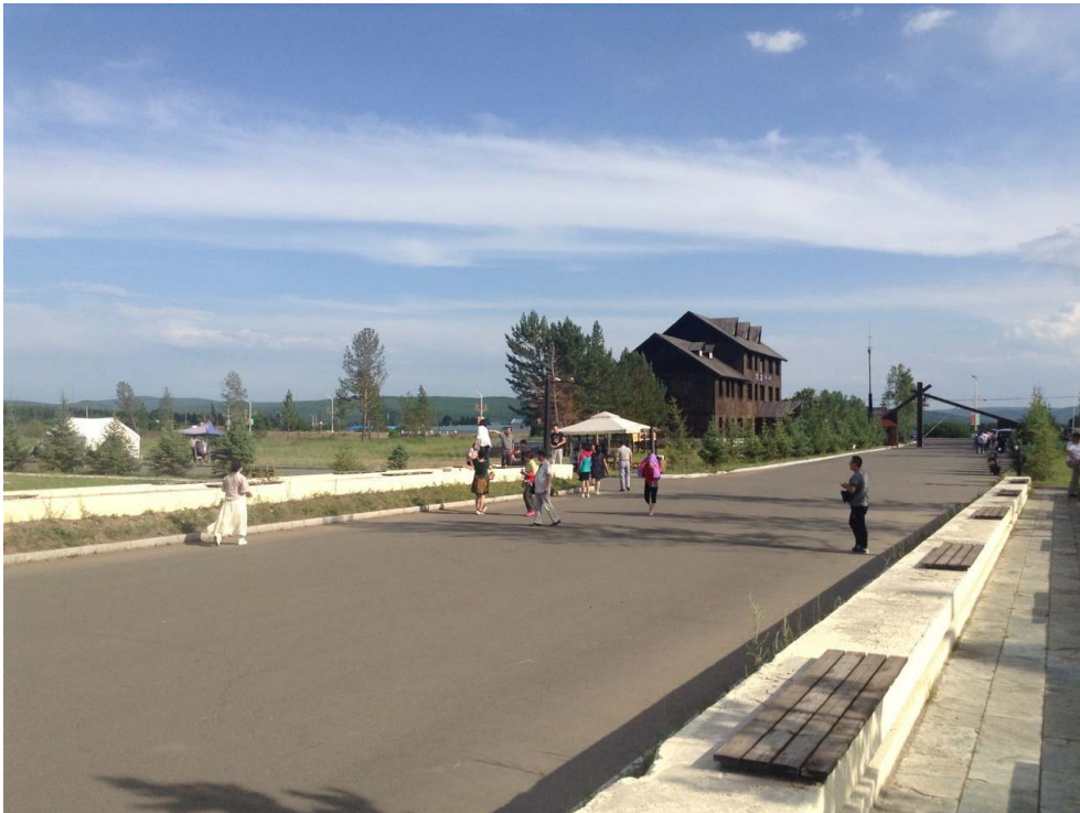
© Aurore Dumont, Aoluguya Village, July 2016