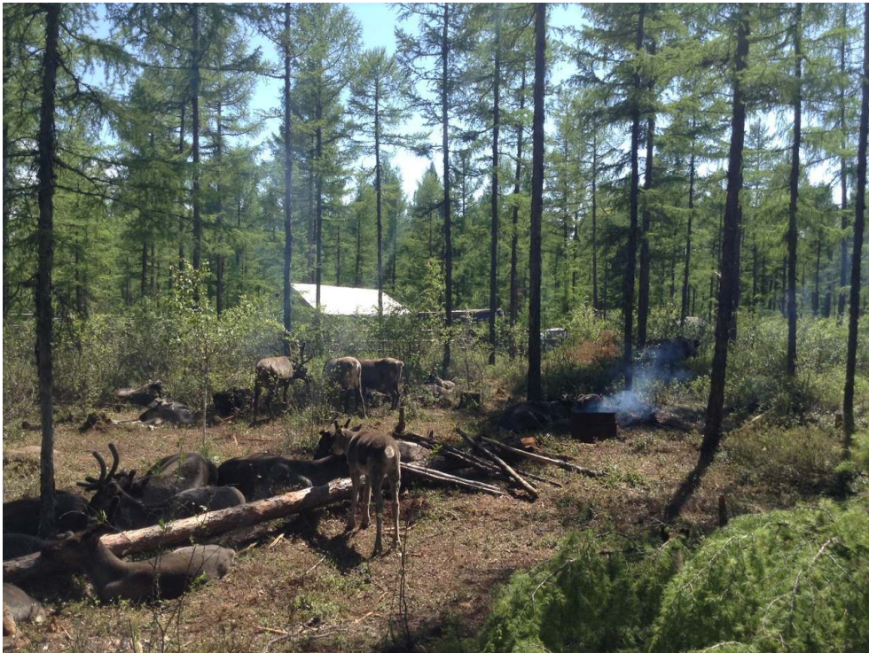
© Aurore Dumont, Alongshan area, July 2016