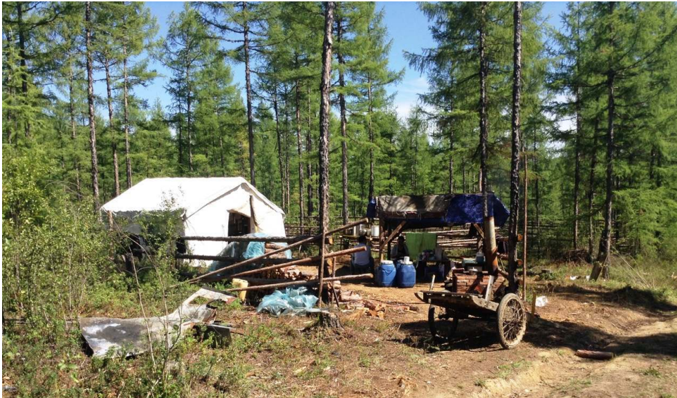
Figure 3. A modern rectangular tent, Pelagiia summer camp, Alongshan area, July 2016

© Aurore Dumont, Alongshan area, July 2016